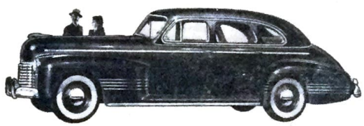
PONTIAC DE LUXE "TORPEDO." Low-priced leader of the greatest line in Pontiac history! 119-inch wheelbase—overall length increased 3 inches. New concealed running boards. Available in five models.

IN THE GREATEST YEAR in its history, Pontiac presents its greatest line of cars—the 1941 Pontiac "Torpedoes"! Three entirely new lines of cars—every one a "Torpedo"—and every model offering you a choice of a Six or Eight engine! And they're led by a new De Luxe "Torpedo" any new car buyer can afford! Bigger? Yet More powerful? Yes! Easier to handle? Yes! More comfortable? Yes! Yet they give you the same record economy that made this year's Pontiacs such a sensation! See these new Pontiacs today. Then you'll know why we say, "It's Another Big Year for Pontiac!"