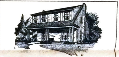
"It takes a heap o'usin' in a house to make a Home..."