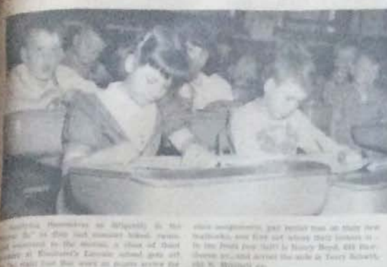
Children, members of the "Tree Town" troop, returned to school this week after a week of absence. They are sitting at their desks in the classroom. The children are smiling and looking towards the camera.

It has been a busy week for the family, but the children are back in school. The mothers are saying, "Peace, it's wonderful!" The children are happy to be back in school and the mothers are happy to see them. The children are smiling and looking towards the camera.