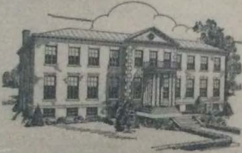
Our Home Office . . . WHEATON, ILLINOIS

Have your automobile checked for safety . . . make sure you are driving a vehicle with good brakes and tires — efficient head lights and tail lights! If your child is in high school, he'll be driving the family car . . . make sure you give him a car that is in good condition!