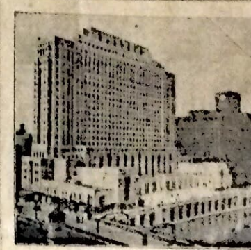
NEW HOME OF THE DAILY NEWS