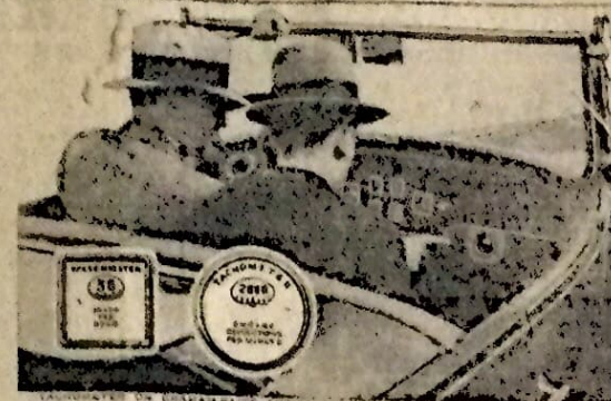
EXHIBITION ON CHICAGO AIR SHOWS LOW ENGINEERS AT FOUR SPEED

Chicago, July 12.—The Chicago Automobile Club today unveiled a novel test which will tell in a matter of 10 to 15 seconds whether a car is four-speed or low-speed. The test is known as the "Four-Speed Test" and is being demonstrated at the Chicago Air Show.