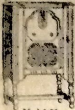
Model 91 $13.75

It Offers You Exclusively POWER DETECTION With the New 45 Tubes